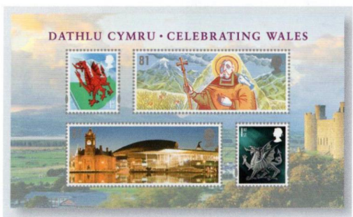
'Dathlu Cymru - Celebrating Wales', the fourth in a series of Country miniature sheets, is to be issued on 26 February 2009, in time for St David's Day.

COMPRISING two 1st class stamps and two largesize 81p stamps, the new miniature sheet will take its place alongside its predecessors of Scotland, England and Northern Ireland, issued in 2006, 2007 and 2008 respectively. Printed in litho, the sheet measures 123mm × 70mm, with stamps set against a backdrop of rural Wales, and would not be complete without a glimpse of the obligatory castle - in this case Harlech, which was originally featured on the 183d Landscape stamp of 1966 making this the perfect tribute to a country proud of its heritage, language and culture. East Anglian design company Silk Pearce has worked with